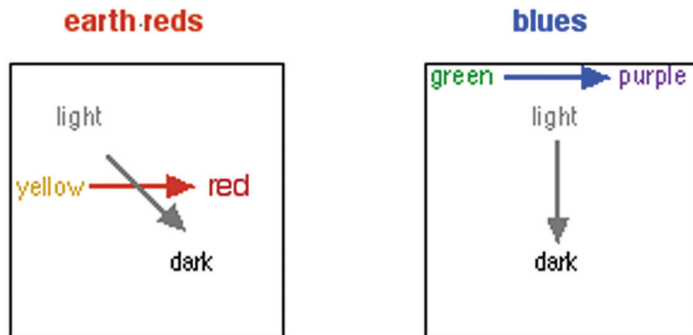
Figure 3 : Schemes for mimicking reflected light