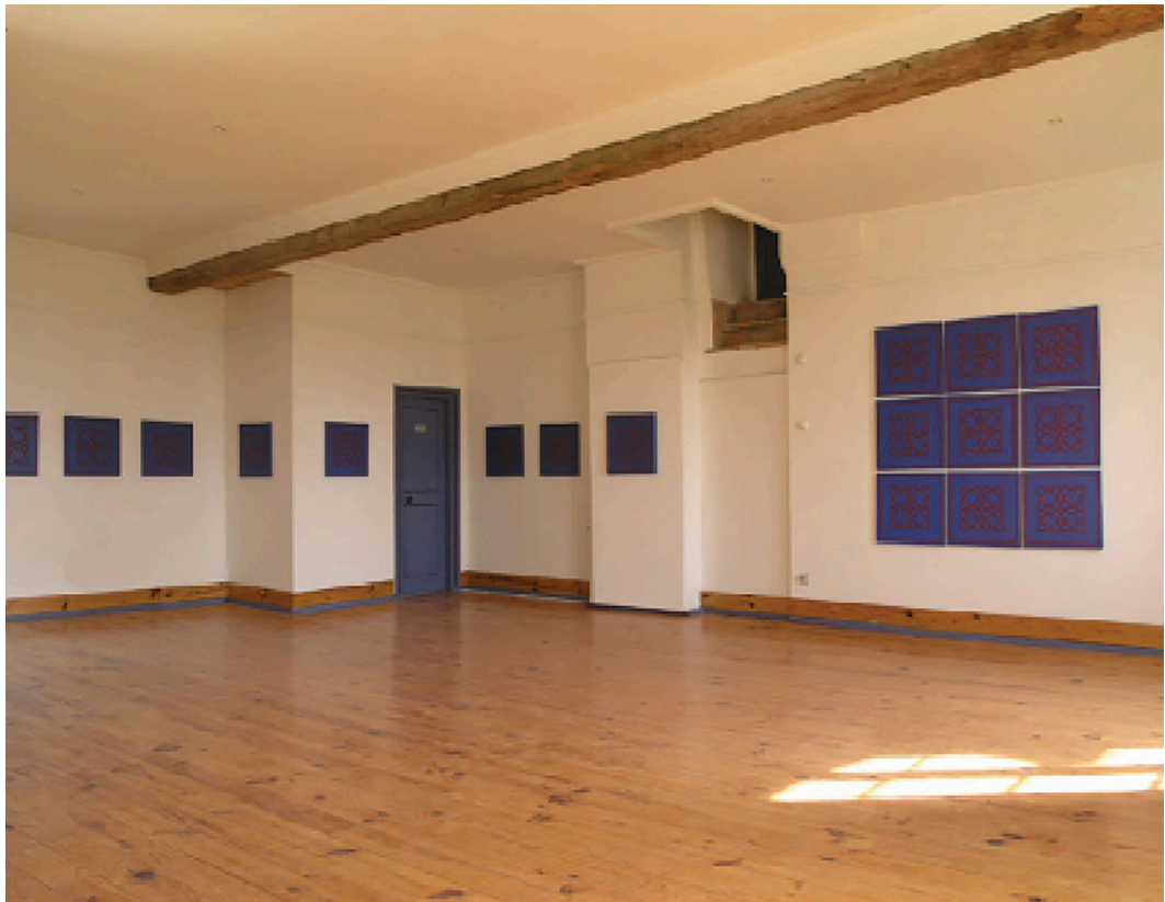
Figure 2 : A nine panel painting from my Islamic Series on exhibition with eight single-panel studies.