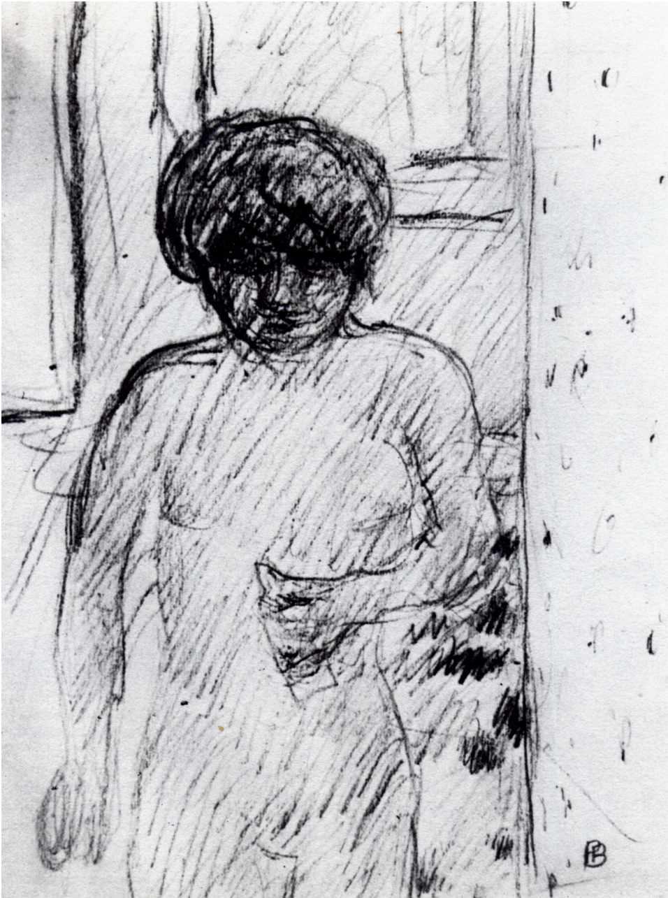
Figure 5 - Bonnard