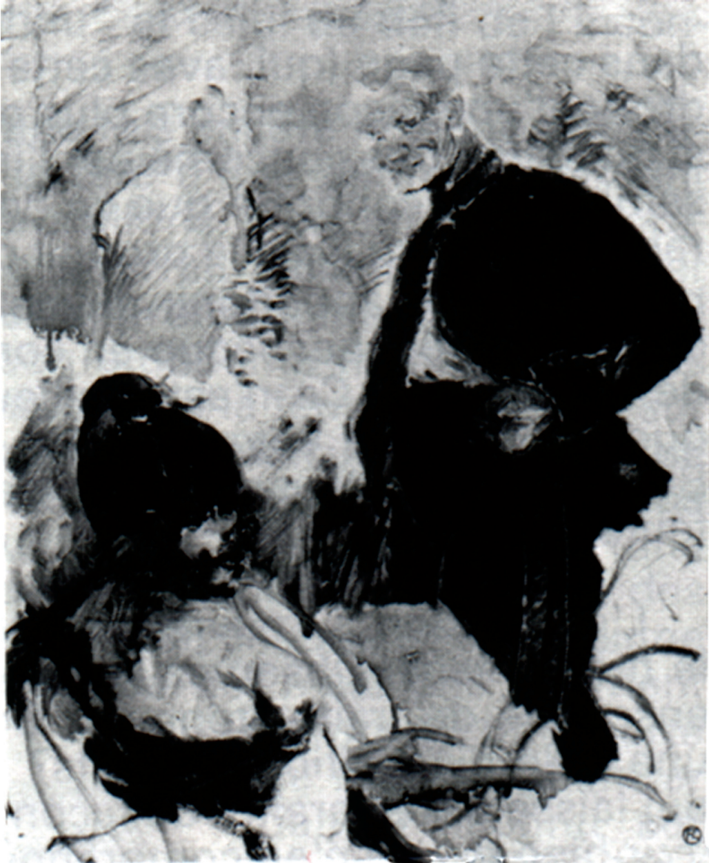
Figure 4 - Toulouse-Lautrec