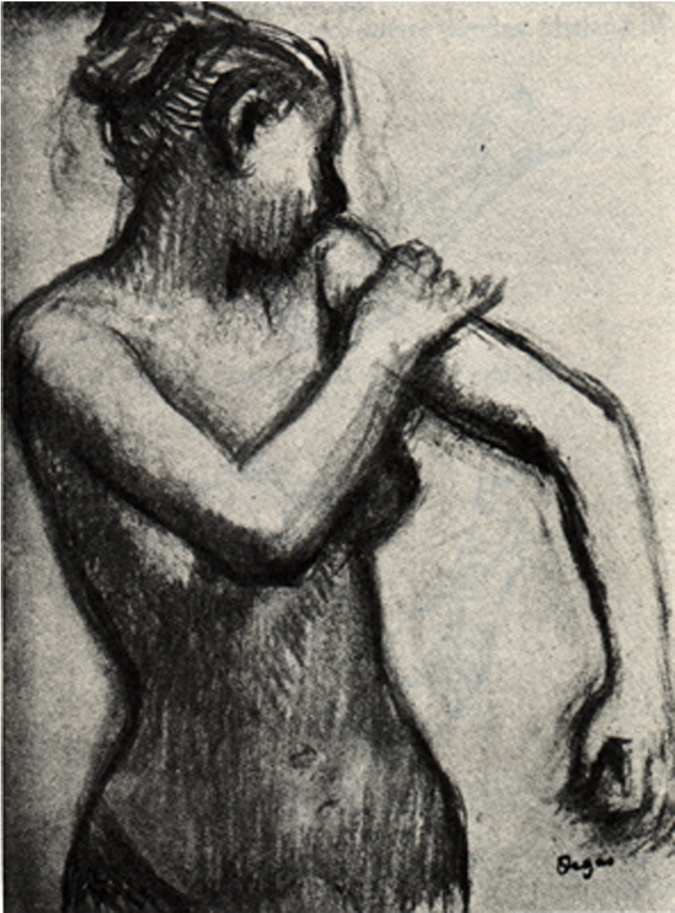
Figure 3 - Degas