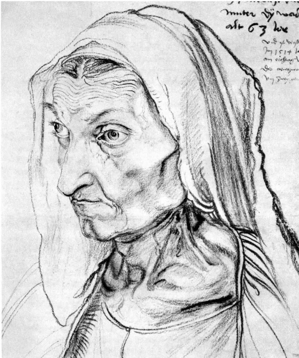
Figure 2 - Dürer: His Mother