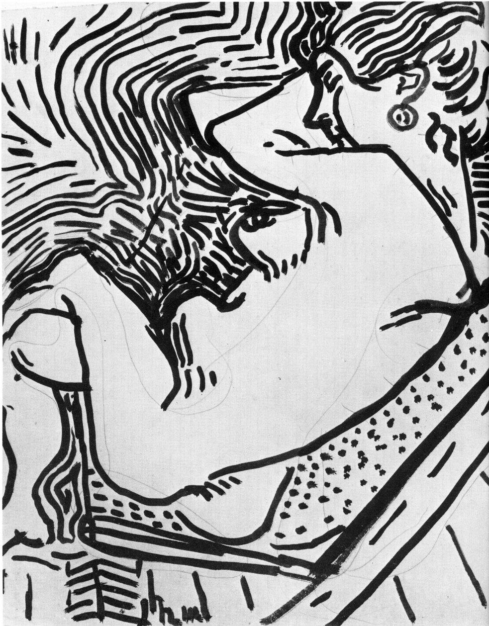
Figure 6 - Matisse